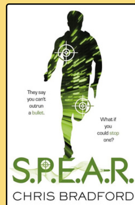
SPEAR Bodyguard meets Marvel