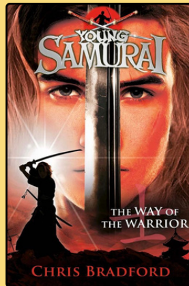
YOUNG SAMURAI The original Karate Kid!