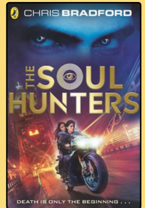
SOUL HUNTERS Lara Croft vs Terminator