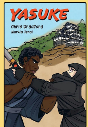
YASUKE Ninja Graphic Novel