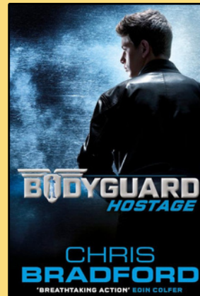
BODYGUARD A Young Jack Reacher!